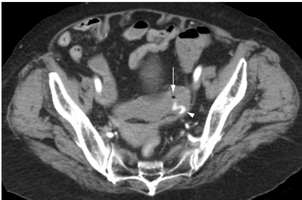
Fig. 1. The abdominal computed tomography image showing an air bubble (arrow) and an extravasation of contrast (arrowhead) in the sigmoid colon.

(NBI) (Fig. 3) revealed a hemorrhagic lesion. What is the most likely diagnosis?