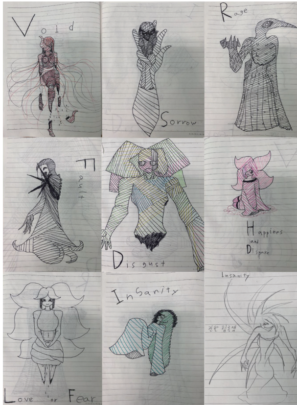
Fig. 1. Self-portraits of the nine alternate identities, drawn by the patient.

treatment process, these alters gained awareness of each other's existence in the patient's psychic world, understood each other's positions, and acknowledged the existence of each other. When the patient was faced with difficult decisions, he occasionally found an appropriate measure by having a meeting between the alters; this was different from the past, where the alters would intemperately expose their emotions uncontrollably. As a result, the alters who were alone and isolated in the past became capable of living with each other and started to show signs of communication and understanding between them. The relationship between the alters, which have become intimate and comfortable with each other, has been depicted in the patient's drawing (Fig. 3).