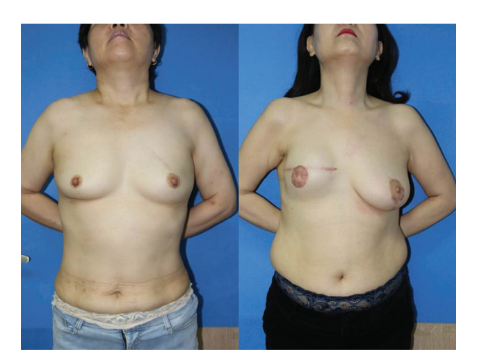
Fig. 3 Postoperative photographic finding. Left was graded highest total visual score (TVS) (54.6 of 60) and right was graded lowest (25.8 of 60) by medical panels. BREAST-Q score is 61 and 52 for satisfaction with breast, 62 and 64 for psychosocial well-being, and 41 and 36 for sexual well-being, out of 100 on each scale.

volumetry, 3D scanning showed significant and consistent association with those two methods 14 and successfully used after autologous breast reconstruction as a postoperative volume evaluation method.<sup>15</sup> We can expect to apply this technique to evaluate not only volume but symmetry, ptosis, shape, and other aesthetic components. It will allow clinicians to make a more objective prediction of outcome and inform what additional management is needed for patients postoperatively.