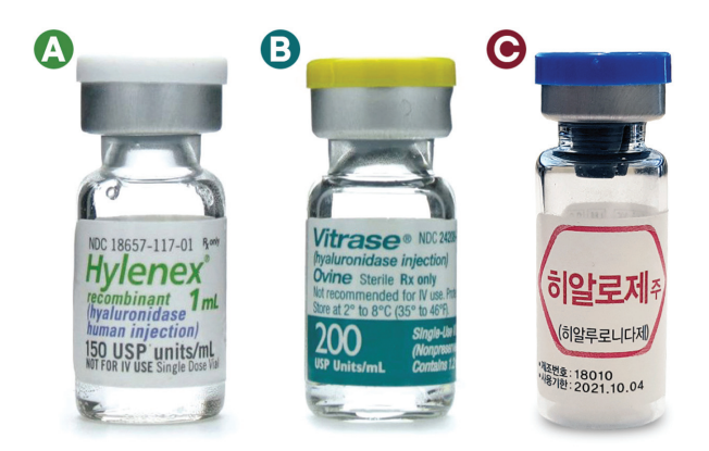
Fig. 2 Various hyaluronidase brands. ( A ) Hylenex 150 USP, ( B ) Vitrase 200 USP, and ( C ) Hyalose 1,500 IU. Each products have different potencies so they should be considered before treatment of filler induced vascular complications.

The half-life of hyaluronidase was reportedly 30 minutes in subcutaneous tissue and 2 to 3 minutes in blood vessels.