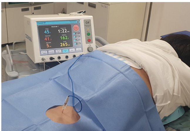
Fig. 1. The application of pulsed radiofrequency procedure on the lumbar dorsal root ganglion.

CRF supplies high-frequency continuous current to the targeted nerves [16]. The tip of the probe during the CRF procedure is at approximately 80°C and induces coagulative necrosis to target nerve structures around the probe tip [16]. Because the high temperature of a targeted structure decreases rapidly with distance