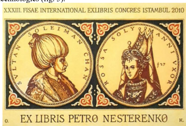
Figure 5. Kryvoruchko O. Ex-libris P.Nesterenko. Computer graphics, gouache. 2010

O. Kryvoruchko demonstrates interesting experiments in the field of computer ex-libris. His works can be perceived as the quintessence of innovation and traditionalism – this artist is able to synthesize computer technologies and traditional graphic techniques in the same sheet. So, he can, for example, create an ex-libris in computer graphics and add color in gouache. This is a kind of connecting bridge from the past to the future, a combination of classical graphic techniques and modern computer technologies (fig. 5).