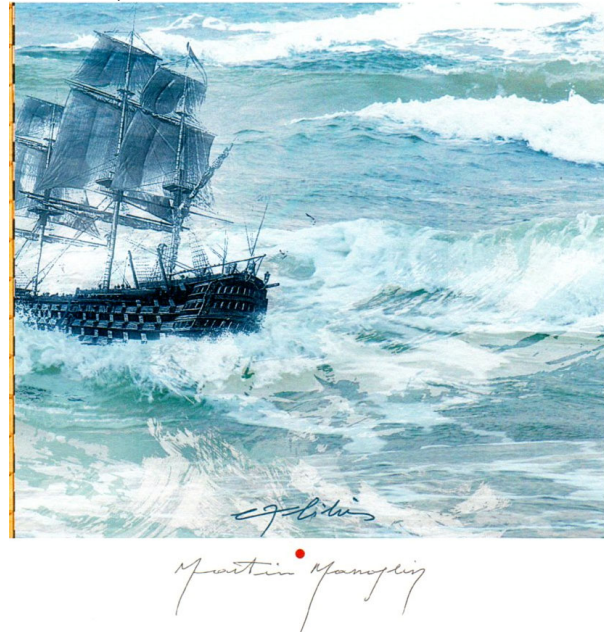
Figure 2. Ex-libris M. Maojlin. Belgium. GRD. 2016

The Belgian artist M. Baeyens creates his bookplates in CRD. His works are extremely intelligent, monochrome – he uses the power of computer technologies to simulate the effect of watercolor painting. (ex-libris G. Willemsen, ex-libris Geerth van der Zee, 2008), often uses sea motifs (ex-libris M. Maojlin, fig.2; ex-libris D. de Bruin). His experiments with the imitation of lithography technique, where we can see the same monochrome, not with watercolor effects, but with the characteristic velvety imitation of a pencil drawing, are interesting too (PF 2013 for W.& M. Meulemens).