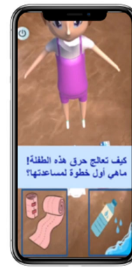
Fig.5 Hakeem AR game