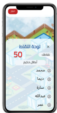
Fig.6 Hakeem scoreboard