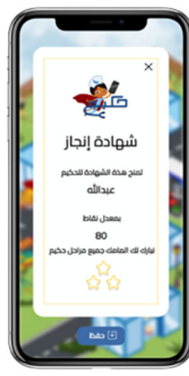
Fig.7 Hakeem certificate