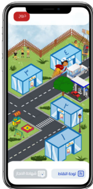
Fig.3 Hakeem map interface