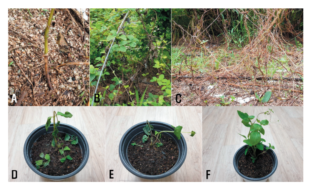
Fig. 1. Stem rot symptoms of bonnet bellflower plants. A–C: Symptoms observed in the field investigated. D and E: Symptoms induced by artificial inoculation tests with Rhizoctonia solani AG-4 isolates. F: A non-inoculated plant (control).