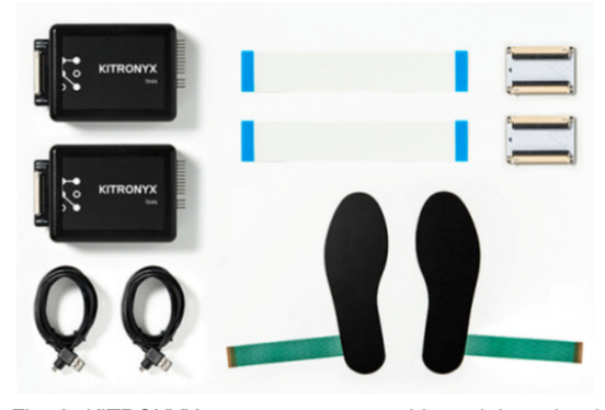
Fig. 2. KITRONYX components to provide real-time visual plantar pressure.

During gait training, a visual plantar pressure feedback information was provided to induce equal weight support on the inner part and outer part of the paralyzed foot during the mid-stance phase of the paralyzed lower extremity. To provide a visual plantar pressure feedback information in real time, MP-2513 (Kytronix, Inc, KOREA), a pressure distribution measurement kit, was used (Fig. 2). A software