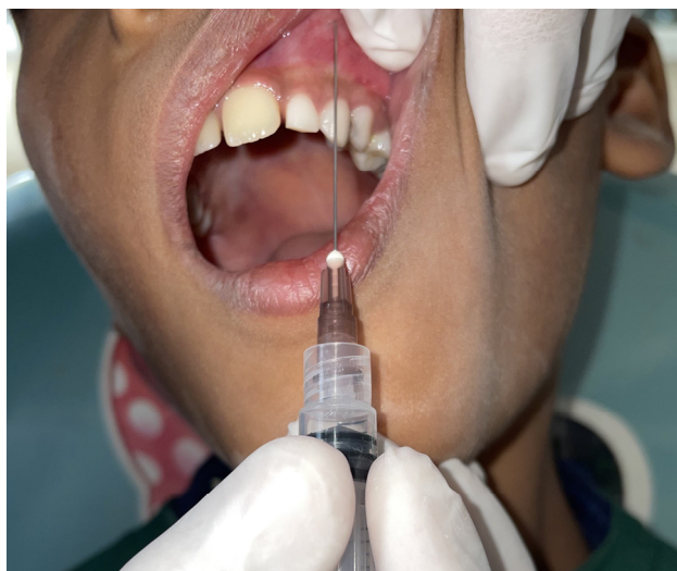
Fig. 1. Figure showing administration of local anesthesia using conventional syringe

Group B (insulin syringe group, 31 gauge), the respective syringes were preloaded with local anesthetic solution. A topical anesthetic was applied at the site of delivery. The child was told that the tooth will be “going to sleep” after administration of magic water. A preloaded syringe was used to deliver the local anesthetic at the site of delivery (Fig. 1 and 2).