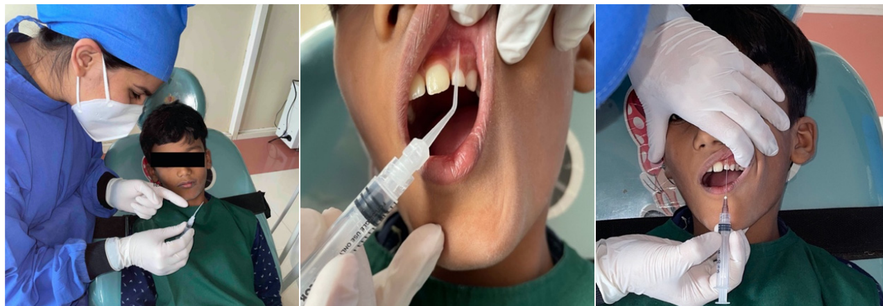
Fig. 3. Figure showing administration of local anesthesia using deception syringe