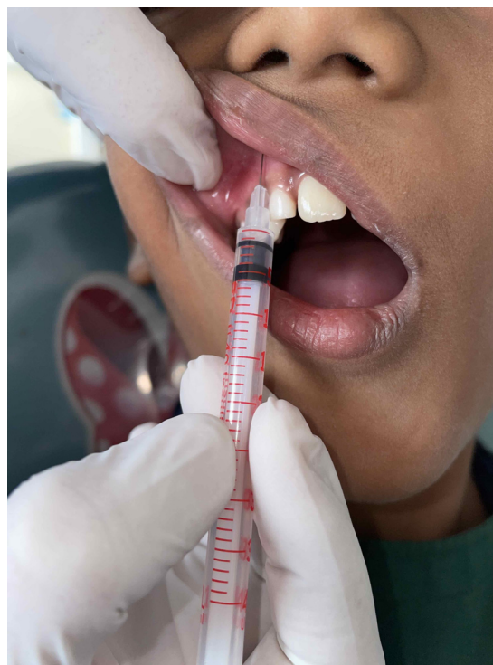
Fig. 2. Figure showing administration of local anesthesia using insulin syringe

Anxiety levels were recorded after the procedure using a pulse oximeter and Venham’s Picture Scale. The patient was then asked to record pain perception using the Wong Baker Faces Pain Rating Scale, in which the faces ranged from a smiling to a sad, crying face. A numerical rating was assigned to each face (from 0, “no hurt” to 10, “hurts worst”) of the Wong Baker Faces Pain Rating Scale [6].