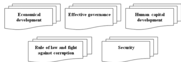
Figure 2: Directions of socio-political transformation

The directions of socio-political transformation are shown in Figure 2.