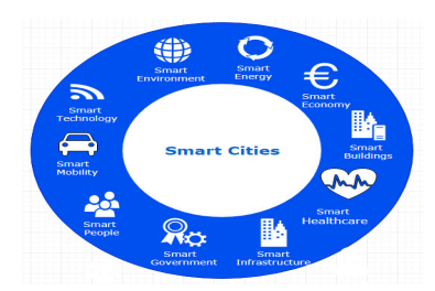
Figure 1. Smart City and Smart Applications

This research paper presents a survey of privacy and security issues and challenges with the available techniques applicable for the construction of Smart Cities. The survey