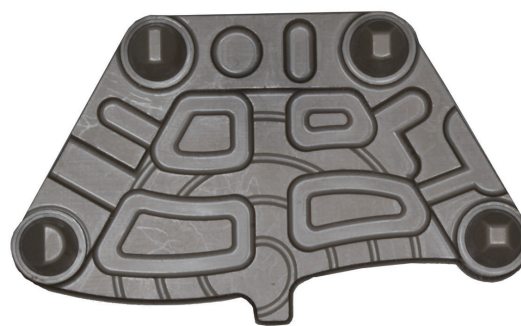
Fig. 1. Reference model (design and production by Institut Straumann AG, Basel, Switzerland).

Five commercially available IOS systems were used: Medit i500 (MEDIT Corp., Seoul, South Korea), Omnicam (Dentsply Sirona, Charlotte, NC, USA), Primescan (Dentsply Sirona, Charlotte, NC, USA), Trios 3 (3Shape, Copenhagen, Denmark) and Trios 4 (3Shape, Copenhagen, Denmark). Scanner software was updated to the latest version for each IOS system at that given period (February 2021) (Table 1).