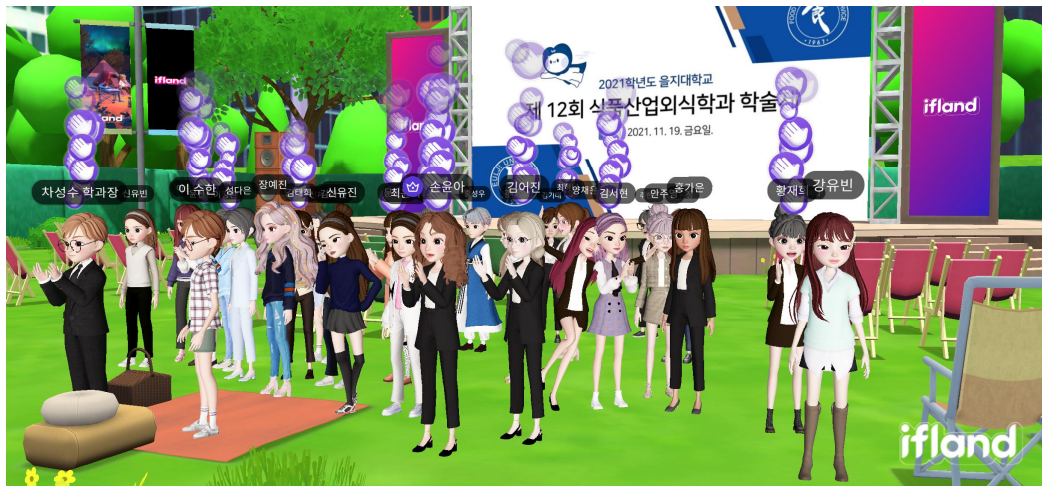
Figure 2: Academic Festival using Metaverse (Department of Food Technology and Service, Eulji University)

implemented or accessed. As more than half of the population was always connected to the Internet, critical usage began to be created in the metaverse.