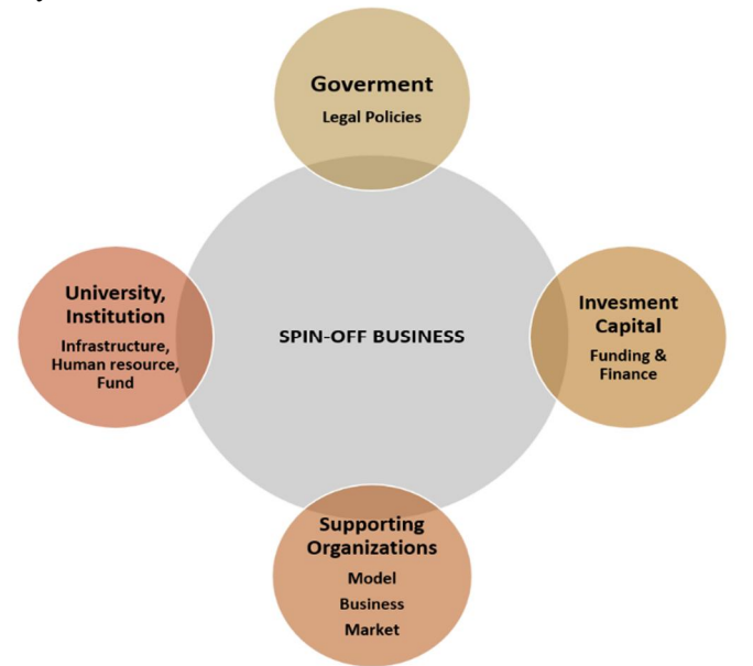
Figure 2. Spin-off enterprise ecosystem model