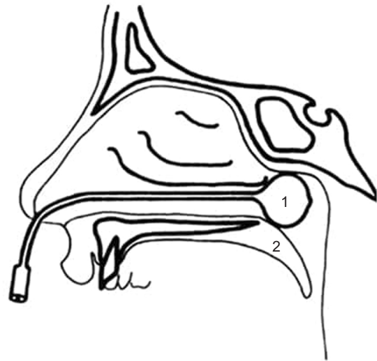
Fig. 3. Posterior nasal packing for posterior epistaxis using a 1 Foley catheter balloon. 2 Soft palate.

Remarkable bleeding is often reported after implant placement, mainly in the mandible 40 . During therapeutic management, early attention should focus on evacuating local hematomas, identifying the damaged artery, and controlling the hemorrhage either with ligation or vessel cauterization. For cases where concomitant epistaxis is not conservatively controlled, a surgical technique involving maxillary sinus osteoplasty with a vascularized pedicle bone flap through a maxillary sinus approach has been reported 8 , wherein a horizontal incision in the upper vestibule was performed in front of the maxillary wall, a mucoperiosteal flap was raised, and a bony cut toward the inferior maxillary wall was made to provide access to the dental implant 41 . The bleeding site from the surrounding mucosal membrane and blood vessel were identified and effectively coagulated 8 . This intraoral method can replace endoscopic endonasal surgery, which can be challenging because of the acute angle from the middle or inferior nasal meatus to the bottom of the maxillary sinus, resulting in reduced visibility 42 .