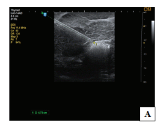
(A) Measuring the length of the needle inserted on the ultrasound

This study got two images from three sausages from five equipments. Thus, it came to get 30 images in total. And, it calculated error rates between the real lengths and those in screen images.