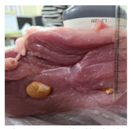
Fig. 1. Sausage on the side of pork.

Sausages were inserted at three targets. The first one was inserted at the target of 1 cm; the second one at the target of 2 cm; the third one at the target of 3 cm.