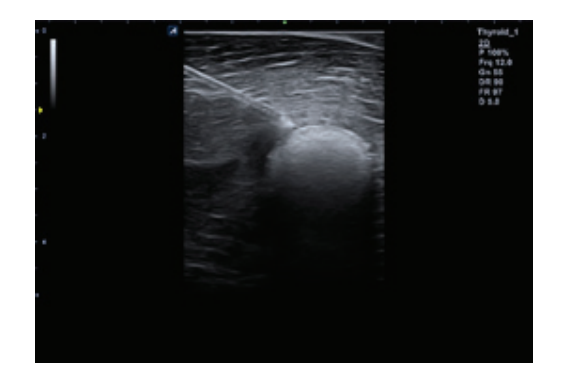
Fig. 4. The tip of the needle touches the highest surface of the sausage.

Fig. 4 show face of the highest part of the sausage on ultrasonographic screen.