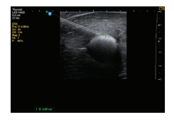
Fig. 6. Measure the length of the needle by drawing a straight extension line from the tip of the needle.

Fig. 6 show as it was difficult to observe the needle near the surface of the chunk, this study began to measure it from the needle end, and drew the extension line to the surface.