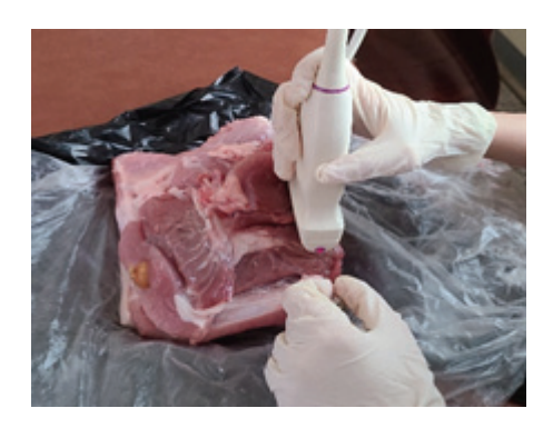
Fig. 3. Injection needles are inserted 0.5cm away from both ends of the probe.

Fig. 3 show this study used the linear probe, and set the points 0.5cm from both end points of the probe as the penetration points. This study penetrated the needle until the endpoint of it touched the sur