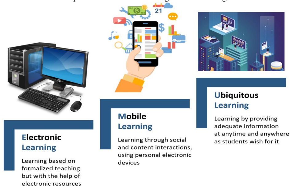
Figure 1. Status of the development of distance learning according to the medium for delivering contents

The present state of the development of distance learning is shown in Figure 1.