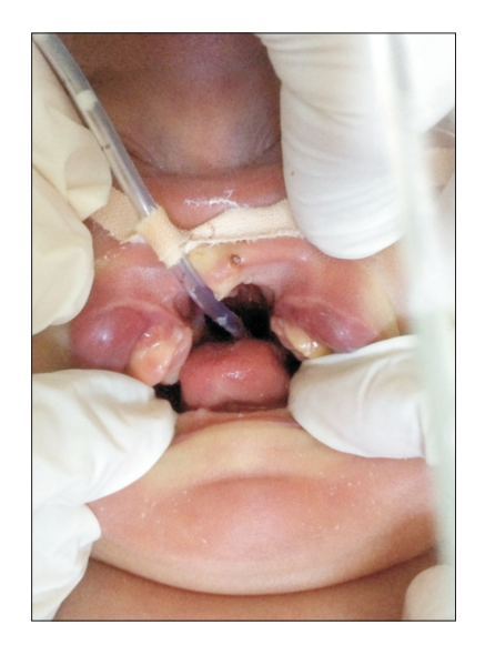
Figure 1. Pretreatment photograph.

An oral impression (Figure 2A) with type C siliconbased impression material (Zhermack zetaplus - putty and light body) was made in a clinical setting where an airway emergency could be handled. A stone cast was formed based on the impression (Figure 2B). A 0.8 mm stainless steel helix was attached to the posterior end of the appliance. Extra caution was exercised regarding the position and dimension of the helix so as not to disturb the infant's palate. After the undercuts on the stone cast were sealed with wax, an acrylic appliance was fabricated with the arms of the helix within the body of acrylic, using cold cured acrylic (imicryl-O 80 orthodontic acrylic). An acrylic button was formed on the anterior aspect of the appliance (Figure 2C). The planned