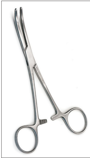
Fig. 1. Rochester-Pean curved hemostatic forceps (16 cm). Saurabh Mohandas Kamat et al: New protocol for simplified reduction and fixation of subcondylar fractures of the mandible: a technical note. J Korean Assoc Oral Maxillofac Surg 2021

The posterior border of the proximal segment is identified and secured using a 16 cm Rochester-Pean curved hemostatic forceps (Fig. 1), with one beak over the cortical portion and the other beak placed into the medullary portion. Following which, the proximal segment is lateralized overriding the distal segment.(Fig. 2) This maneuver serves a dual purpose