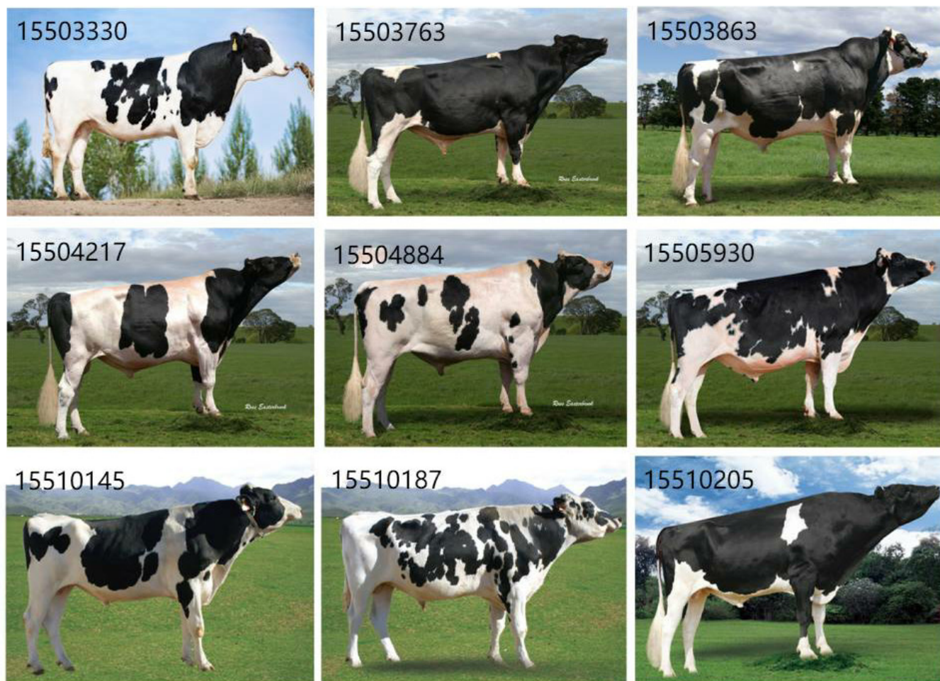
Figure 1. Nine bulls used for this experiment. The number in the upper left of each bull is bull number registered by Holstein Association of China.

Ovaries were obtained from cows at a local slaughterhouse and were transported to the laboratory at 35°C in 0.9% NaCl