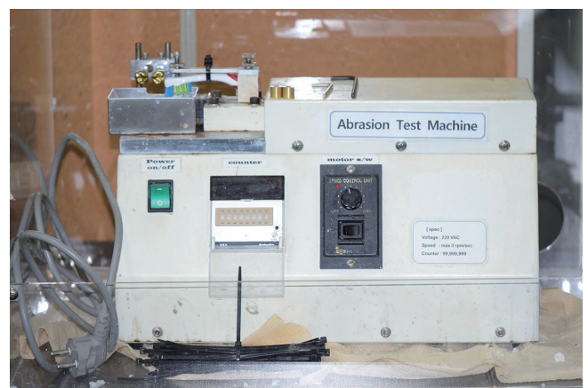
Fig. 4. Abrasion test machine for color sustainability test (Shinhung, Seoul, Korea).

Rectangular specimens in pairs were placed in a separate laboratory dish, and the acidic solution was filled in a ratio of 1 mL/cm 2 of the surface area of the specimens. The containers were sealed and maintained at 36.5°C for 7 days. The test solution from which the metal ions were eluted was quantitatively analyzed by inductively coupled plasma-optical emission spectrometry (ICP-OES, PerkinElmer Inc., California, USA). Fe, Cr, Mn, Ni, Si, and Ti were set to be analyzed. Fe, Cr and Mn are classified as heavy metals, and Ni is allegedly known as an allergen. Si is an element composing of raw materials for stainless steel and the coating of SSCs. Ti is a constituent material of the coating of TiNCs. The total metal ion releases from the 2 metallic materials were recorded.