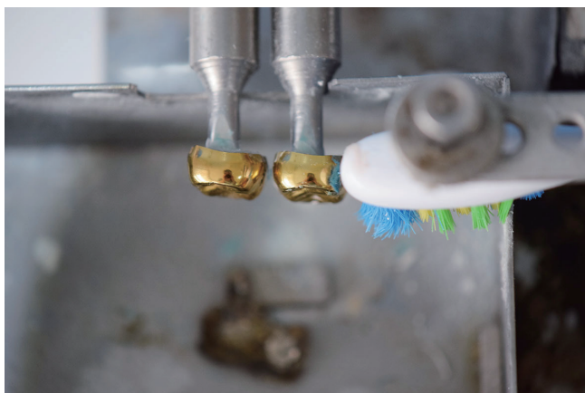
Fig. 5. Subjected crowns and tooth brush on the moving table of abrasion test machine.

The means of TiNC group and SSC group were 395.53 \pm 105.90 Hv and 278.70 \pm 31.45 Hv respectively (Table 2). Hardness of TiNCs was higher than that of SSCs. There was a significant difference between the two groups ( p < 0.0001 ).