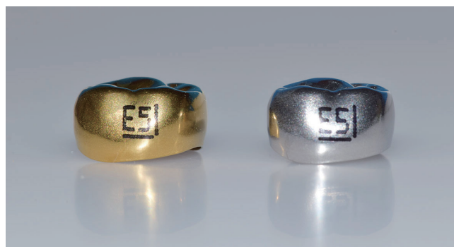
Fig. 1. Titanium-nitride coated crown (left) and stainless steel crown (right).

Ten TiNCs and 10 SSCs were used for the hardness test. Crowns were embedded in self-cured acrylic resin (Pace technologies, Arizona, USA) with the occlusal surface up. For convenience, crowns were buried in groups of 3, 3, and 4 for each crown type. A cylinder shape of the specimens was sized 30.0 mm in diameter and 18.0 mm in height. The surface was ground by sandpaper grip 400 (Buehler, Illinois, USA) until the occlusal surface was visible. Then the surface was ground by sandpaper grip 600 and 800 sequentially. At least 3 parts apart from each other were exposed on the occlusal surface (Fig. 2). Each exposed part was at least 2.0 × 2.0 mm. The prepared surface was finally polished with 3 μm diamond suspension (Buehler, Illinois, USA).