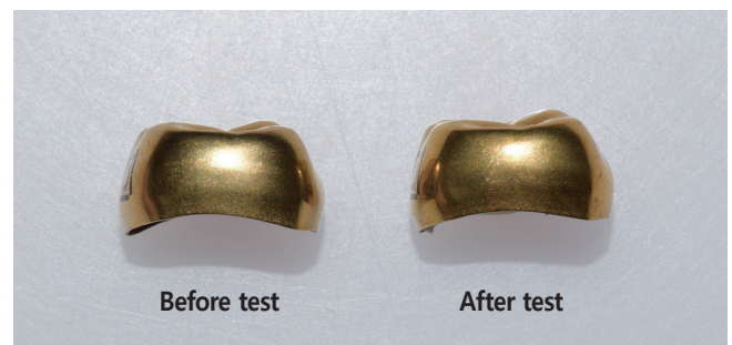
Fig. 6. Titanium-nitride coated crowns before and after color sustainability test.

TiNCs = titanium-nitride coated crowns, SSCs = stainless steel crowns