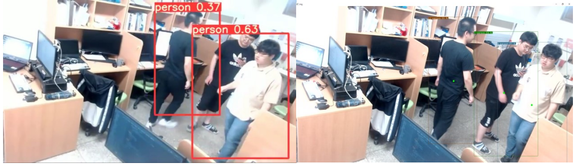
(a) Detect objects using Yolov5

The video used for the test in this paper is tested with an image of 1920 * 1080 resolution of 28.12 FPS. In addition, when using the Euclidean technique, perspective is applied on the image, and the effect of the Y-axis is large in a situation where a person is touching the floor, making it easier to track the distance between objects. The video tracking since then uses the video looking down from the height of the CCTV installation. The three test results in Figure 4 are explained, and in each image of (a), (b), and (c), people are referred to as A, B, and C from the left.