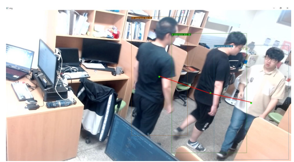
(c)Detect objects after measuring the distance between objects using Yolov5 + DeepSORT