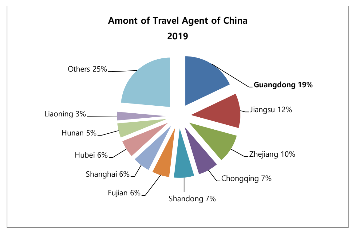
Figure 2. Amont of Travel Agent of China 2019