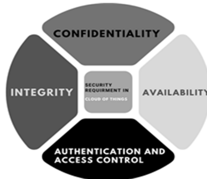
Figure 2. Security Requirements in CoTs