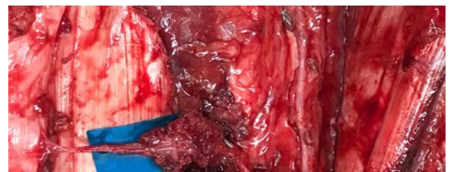
Fig. 1. Intramuscular dissection of the perforator.

All flaps except one survived well without partial loss of tissue. The