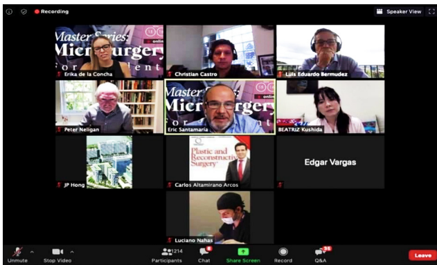
Fig. 2. Master Series: Microsurgery for Residents (MSMR). Lower limb flaps online discussion.