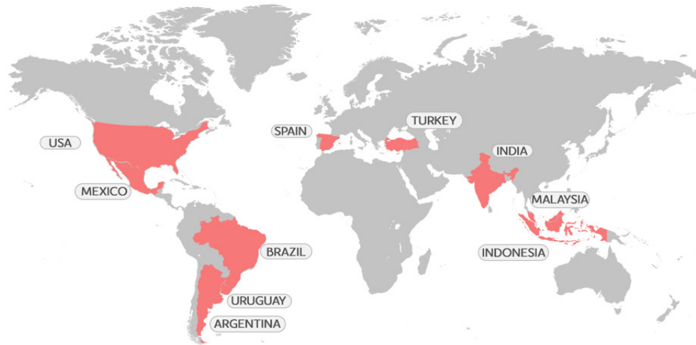
Fig. 1. Country of origin of the Master Series: Microsurgery for Residents (MSMR)'s attendees. Only the top 10 are lightened.