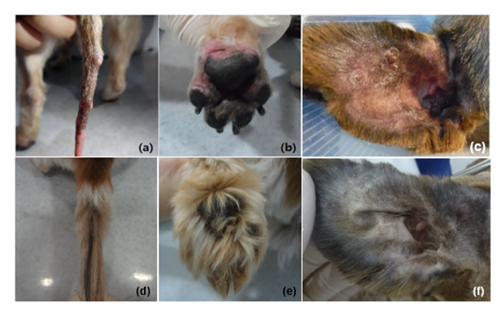
Fig. 1. Photographs of the physical examination at the first visit (A-C) and at 441 days after oral fluralaner administration (D-F). Erythema, alopecia, and erosion on the tail (A). Edema, erythema, and alopecia with fissures on the foot pad (B). Erythema, scales, and crusting on the ear pinna (C).

A 10-year-old castrated male Shih-tzu dog presented with a history of generalized demodicosis refractory to conventional therapy with antibiotics, ivermectin, and amitraz baths for a year at a local animal hospital. In addition to a concurrent severe pruritus, physical examination revealed cutaneous lesions with erosion, ulceration, erythema, scaling, and crusting on the face, tail, and all foot pads (Fig. 1A-C). Skin cytology revealed numerous degenerated neutrophils and mixed infections of moderately infective cocci and Malassezia. No ectoparasites were observed in skin scrapings. Laboratory examinations revealed neutrophilic leukocytosis (white blood