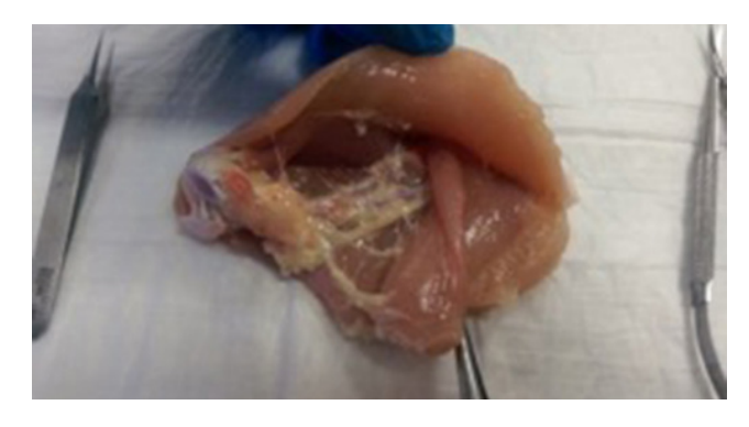
Fig. 3. Prepared chicken thigh with exposed femoral artery. Chickens used in the experiment were purchased at a mart.