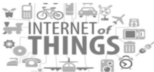
Fig. 1. Internet of Things (IoT) [2]

Internet of Things (IoT) is an application development domain that incorporates a range of technologies. Kevin Ashton invented the term 'Internet of Things' in 1999. The first remarkable aspect of IoT came from the term that describes. It's a collection of actual interacting things or Objects." Physical objects may be people, vehicles, environments, machines, etc. In addition, each "Thing" has an identifier in order to be identifiable.[1]