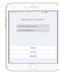
Figure 9: Emergency Authorities