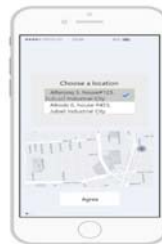
Figure 4: Location Interface