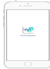
Figure 2: Application Icon