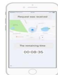
Figure 11: Arrival Time for Emergency