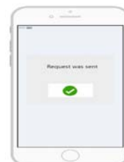
Figure 10: Sending Confirmation Interface