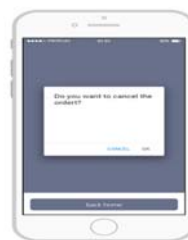
Figure 8: Cancellation Interface