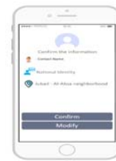
Figure 5: Information Confirmation Interface