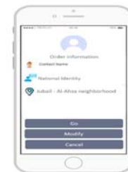
Figure 7: Modifying Interface