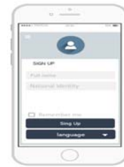
Figure 3: Sign-up Interface