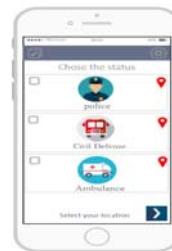
Figure 6: Status Chosen Interface