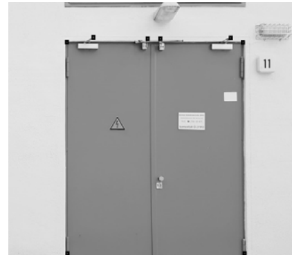
Fig. 4. Detected corners

The resultant image after applying corner detector has corners marked on it as shown in figure 4.