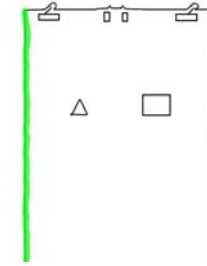
Fig. 7. Fill ratio vertical line

To overcome the issues related to the existing method such as accuracy, some additional steps are introduced just like, canny threshold setting that we used in the initial step to reduce the computational cost.