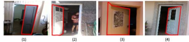
Fig. 10. Results of detected partially open/close doors.

Table 3 shows the results of images for resolution 320x240. Simple category has an accuracy percentage of 98.2% and a false/no-detection percentage of 1.8%. Medium category has an accuracy of 94.4% and a false/no detection percentage of 5.26%. Complex category has an accuracy of 88.0% and a false/no-detection percentage of 12%.