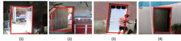
Fig. 9. Results of detected doors of obstruction category.

Figure 9 represents doors detection with obstruction, and Figure 10 represents the category of partially opened/closed doors. It can be observed that the proposed technique is efficient enough to accurately detect the corners of the doors, even when it comes to the partially closed doors.