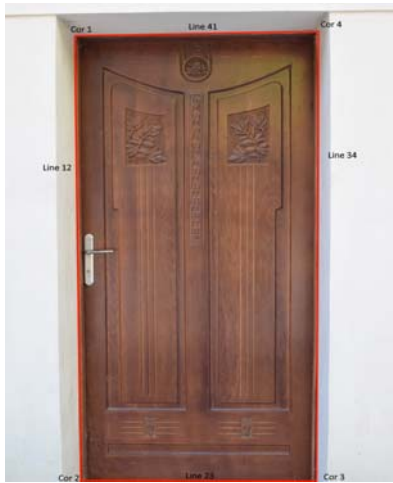
Fig. 5. Geometric model.

Where, Diogn represents the length of the diagonal of an image. Rd_{ab} should be in the range of (0 - 1) and Dl_{ab} should not be less than 0 degrees and greater than 90 degrees. Each 4-corner group must pass through all the geometric requirements.