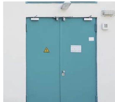
Fig. 1. Down sampled input image

Consider the input image ( I_i ) from the camera, having the dimensions x * y * \beta , where x = [1, 2, \dots, X] , y = [1, 2, \dots, Y] and \beta = [R, G, B] . Images having larger dimensions consume more time. I_m is down sampled to reduce the computational cost and converted to gray scale. Figure 1 and Figure 2 show the down sampled and gray scale input image respectively.