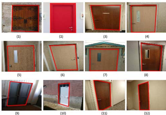
Fig. 8. Results of detected doors of Simple, Medium, and Complex categories.

Figure 8 shows the results of detected doors, Images from 1 to 4 represents the simple category, while from 5 to 8 represents the medium category, and images from 9 to 12 represents the complex category.