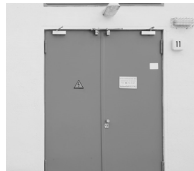
Fig. 2. Gray scale input image

Since, the whole technique is based on edges and corners, canny edge detector is being used for the extraction of the edges, and the edge map determines the number of corners. To improve the computational cost a formula has been developed to assign threshold values, this formula generates minimum number of corners but at the same time enough for accurate detection of a door in an image. In the proposed method, first step is down sampling and when the image has been down sampled, standard deviation of the whole image