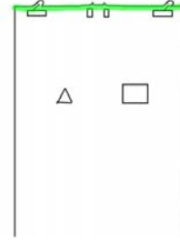
Fig. 6. Fill ratio horizontal line.