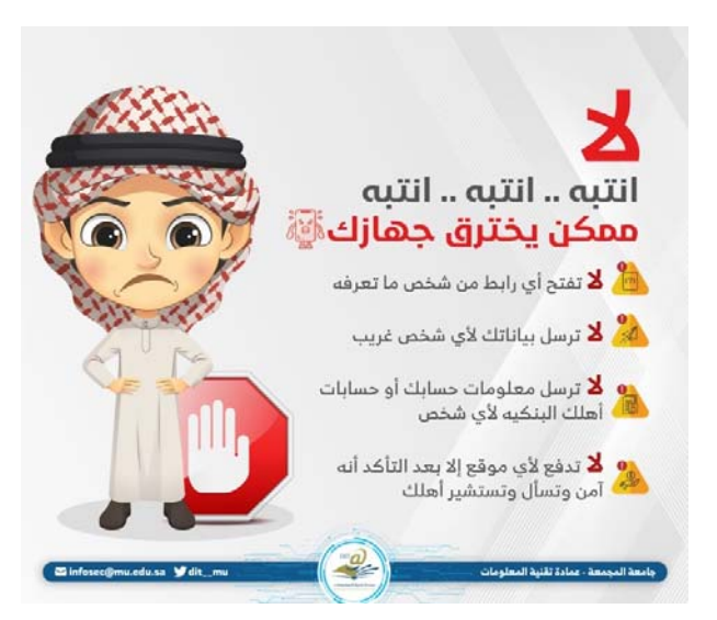
Fig 1: A phishing website written in Arabic

In this paper, two experiments were consequently executed using 30 participants. The participants were divided into two groups: a Control and a Treatment group, each consisting of 15 participants. In the first experiment (Experiment 1), a phishing message (written in Arabic) was sent to the Treatment group. The message offered a discount for a popular game that would be known to most of the children, whether male or female. The message contained a hyperlink that directed the users to a website, which informed them that they had been the target of a phishing attack. The website consisted of information about phishing and the most common phishing scenarios, with the aim of training users, improving their knowledge, and thereby avoiding any future phishing attacks (see Figure 1).