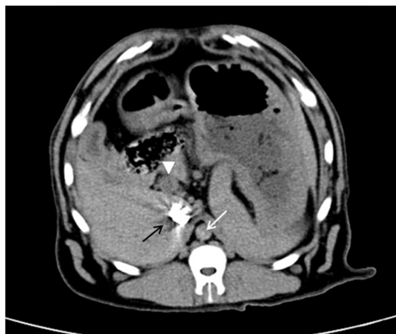
Fig. 1. Grading scheme for hepatic hilum depiction and image artifacts. Distinct anatomic detail; score 0, distinct anatomic detail and streak; score 1 (white arrow), anatomic detail clear and hypoattenuation band or streak; score 2 (arrowhead), obscured anatomic detail and severe radiolucent halo; score 3 (black arrow).

Statistical tests were performed using commercially available statistical analysis software (SPSS 14.0, SPSS Inc., Chicago, IL, USA). All data are expressed as means \pm standard deviation for each injection protocol.