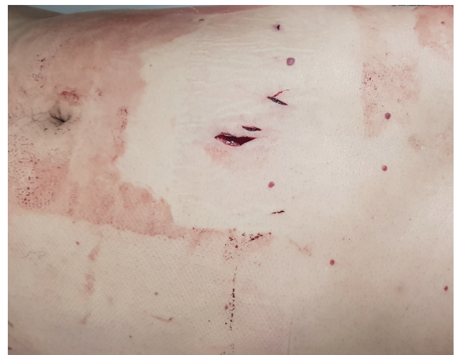
Fig. 2. Stab wound in the abdomen with peritoneal penetration.

The numerical pain scale scores and FAST findings were not significantly different between the two groups. With respect to laboratory test results, a significant difference was observed in the percentage of neutrophils (negative: 55.6% [range 47.4–66.1%] vs. positive: 79.8% [range 77.6–88.2%], p < 0.001 ), but other laboratory test results including the white blood cell count did not show significant differences (Table 2). Among the stable patients, 81