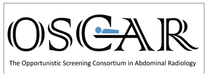
Fig. 2. The OSCAR. OSCAR represents a group of investigators interested in image-based body composition analysis. In particular, a multi-center trial will seek to develop and validate a process for applying CT-based opportunistic cardiometabolic screening utilizing fully automated body composition tools. This large-scale effort aims to address variations related to patient demographics and different technical environments, as well as explore the prognostic value of the combined body composition measures for predicting future adverse events. The ultimate goal is to provide a generalizable, vendor-neutral CT solution that can translate to routine clinical use and add substantial value to patient care without the need for additional patient time or dose exposure. OSCAR = Opportunistic Screening Consortium in Abdominal Radiology