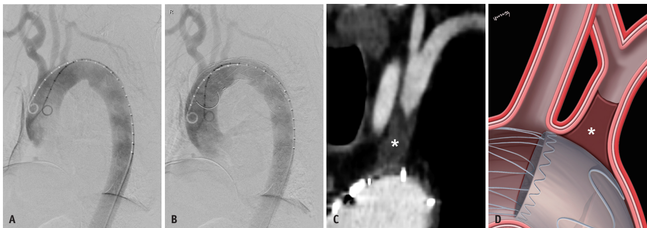
Fig. 1. Images of a 55-year-old man (patient in case 4) who presented with TAI after a traffic accident.

Figure 1A and B show the images of a patient who underwent zone 2 TEVAR without prophylactic LSA embolization for a grade III aortic injury; endoleak did not occur in this patient. Follow-up CTA images show a thrombus