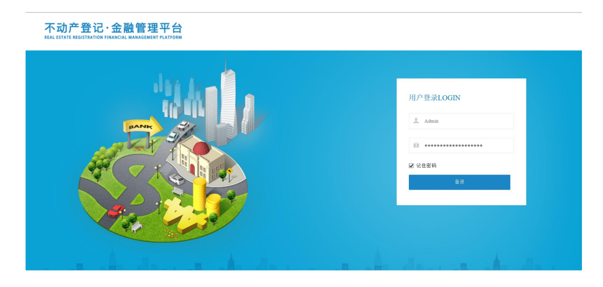
Figure 2. Real estate registration financial management platform screen

The figure below is the login screen of the homepage of the real estate registration financial management platform based on the Google browser design and development.