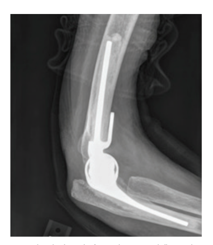
Fig. 2. A lateral radiograph of case 4 showing a total elbow implant in place.

Four patients (44%) had a reoperation for soft-tissue complications after the primary reconstruction (cases 1–3, and 8), including dehiscence or nonhealing of infected wounds. One patient initially underwent local tissue advancement for wound closure