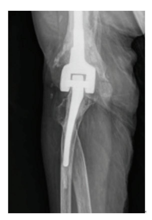
Fig. 1. An anteroposterior radiograph of case 2 showing a total elbow implant in place.

Following soft-tissue reconstruction, seven patients (78%) underwent reoperation and five patients underwent more than one