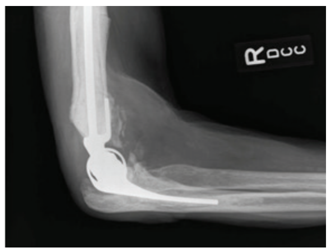
Fig. 3. A lateral radiograph of case 5 showing a total elbow implant in place.

Median implant survival following soft-tissue reconstruction was three years (range, 2 weeks–14.6 years). There was no patient