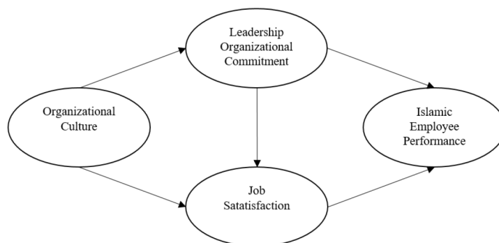
Figure 1: The Framework of the Research

variables, including organizational culture, organizational leadership commitment, job satisfaction, and Islamic bank’s employee performance in Indonesia. The detail of the framework of the study is provided in Figure 1.