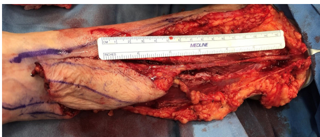
Fig. 2. Median vessel dissection was carried out until the desired pedicle length was achieved (15 cm).