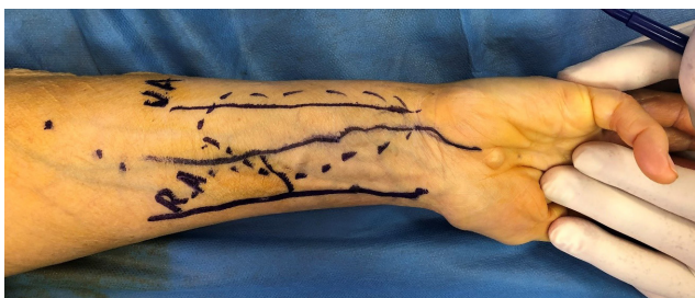
Fig. 1. Preoperative flap markings. The radial artery (RA), ulnar artery (UA), and median artery in between are drawn over the volar forearm surface, according to the ultrasound probe.