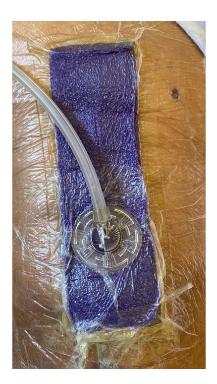
Fig. 3. Incisional negative pressure wound therapy (iNPWT) dressing. Example of iNPWT dressing utilized to create physical barrier from contamination, bring incision edges together, and remove excess fluid and infectious material.

We have found that local tissue rearrangement is sufficient to achieve definitive closure in almost all cases when primary closure is not possible. There were no patients that required free tissue transfer in this study. A history of radiation therapy to the surgical site requires wide resection of irradiated tissue and often results in a large skin and muscle defect that may not be amenable to local tissue rearrangement. Free tissue transfer may be considered; however, lack of recipient vessels and need for prone positioning of the patient limit the widespread applicability of this modality. Other options include regional myocutaneous flaps outside the zone of injury, depending on the location of the wound [25,26]. All wounds should then be managed