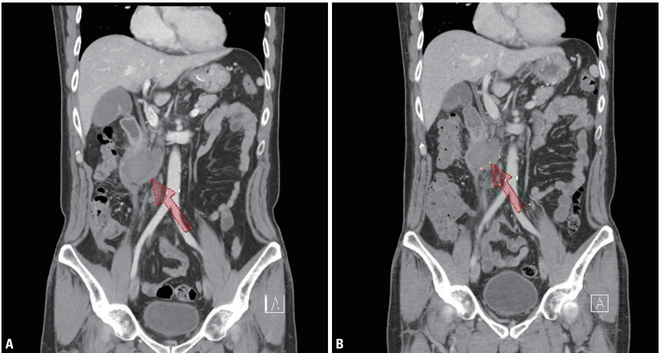
Fig. 3. Follow-up computed tomography (CT) on admission days 10 and 16. (A) CT revealed a decrease in the volume of high-density fluid in the right anterior pararenal space, suggestive of hematoma (arrow, 9.6→7.1 cm), on admission day 10. (B) CT revealed a decrease in the volume of high-density fluid in the right anterior pararenal space, suggestive of hematoma (arrow, 7.1→5.4 cm), on admission day 16. Finally, there is no evidence of dilatation of the stomach and duodenal bulb.

The first follow-up CT scan was performed 10 days after starting supportive care. The CT scan revealed a decrease in the size of the retroperitoneal hematoma from 9.6 cm to 7.1 cm, and there was no evidence of dilatation of the