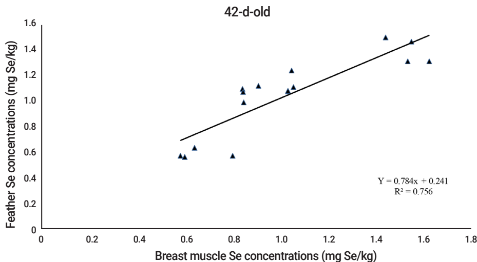
Figure 2. The relationship of selenium concentrations in breast muscle and feather of growing quails at 42-d-old.

The results of this trial showed that meat color and meat pH at 45 min post-mortem were not altered by Se supplementation. However, pH of meat at 24 h post-mortem increased with Se supplementation (Table 5). Presently, there is no available published report on the effect of Se supplementation on meat quality in quail. Zhang et al [24] found that Se supplementation (0.3 mg/kg) from SS and SeMet did not improve meat color of 56-d-old offspring of broiler breeders. However, Wang et al [25] reported that broilers fed Se from SS and SeMet (0.15 mg/kg) resulted in increasing meat color value of breast muscle at 8 and 16 h post-mortem. Zhan et al [26] reported similarly that adding SS or SeMet in finishing pig diets caused an increasing trend of the pH value of loin muscle at 45 min post-mortem in Se-treated groups. These results are similar to ours presented here. Generally, lower meat pH reduces the muscle protein ability to bind to water, causing