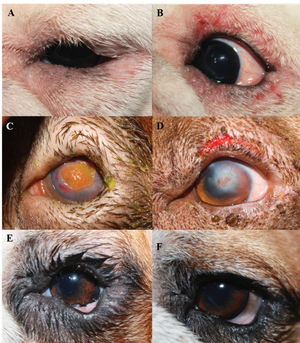
Fig 3. Pre- and postoperative appearances in case 1 OS (A, B), case 2 OS (C, D), and case 3 OS (E, F). External appearances at initial examination in case 1 (A), case 2 (C), and case 3 (E), respectively. (B) Appearance immediately after sutures removal. Apposed skins areas were healed, and corrected entropion was observed 16 days after surgery. (D) Granulation tissue and corneal superficial vessels were significantly reduced 7 days after surgery. (F) At 405 days after surgery, epiphora and blepharospasm were not observed. [Note that entropion of upper and lower eyelid, and lateral canthus, causing trichiasis and severe granulation tissue formation, neovascularization, and corneal edema were observed in case 2 (C). Marked tear staining of eyelid margin and periocular surface before surgery was also observed in case 3 (E)].

A study in which the Stades method was performed to correct the entropion of the upper eyelid reported no recurrence of clinical signs for up to 36 months in 21 dogs, including English cocker spaniel, Basset hound, Bloodhound, Fila Brasileiro, and mongrel dogs (5). On the other hand, when the upper and lower eyelid entropion occur together, Hotz-Celsius procedure and lateral eyelid wedge resection (10), or the