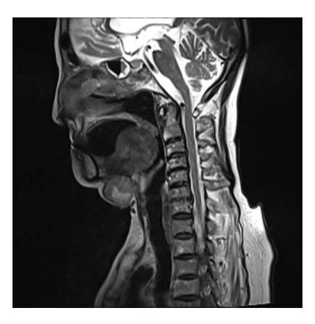
Fig. 2. T2-weighted magnetic resonance imaging revealing a 3-cmsized, ovoid, heterogeneously enhanced mass in the submental area.

A 3-cm-sized ovoid, heterogeneously enhanced mass in the submental area was observed on both T2- and T1-weighted images with slight enhancement, located lateral to the left sternocleidomastoid muscle; several lymph nodes less than 1 cm in size also showed high signal intensity. Fine needle aspiration biopsy was performed of both the mass and lymph nodes (Fig. 2). The final diagnosis was well-differentiated squamous cell carcinoma.