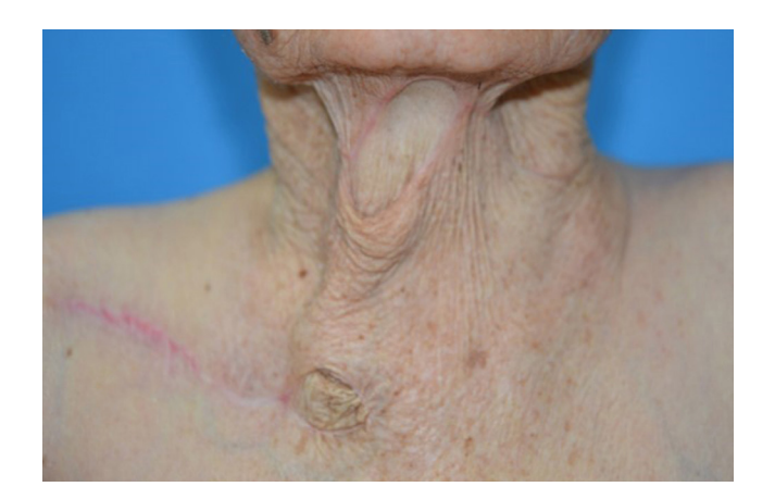
Fig. 5. One-year follow-up photograph.

covered without tension. Then the donor site was immediately sutured with minimal tension (Fig. 4). The flap remained viable without color change throughout admission (12 days postoperative). The patient was stable during the 1 year follow-up period without any complications, and was satisfied with both cosmetic and functional outcomes, reporting no limitations of cervical motion (Fig. 5).