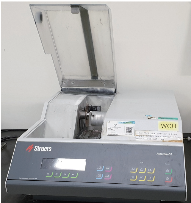
Fig. 1. Precision cut-off machine used in this study.

In group II, the surface of each specimen was air-dried for 5 seconds, and PAA was applied for 10 seconds. After washing with water for 5 seconds, the surface was air-dried for 10 seconds. Subsequently, RMGIC was applied and cured using the same method used for group I.