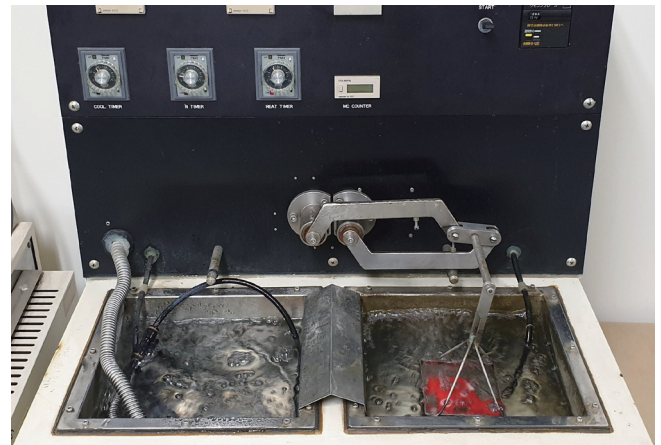
Fig. 2. Thermocycling machine. The samples were thermocycled for 5000 cycles. Thermocycling process was performed between 5 - 55°C.

All of the cured RMGIC specimens were subjected to thermocycling process between temperature of 5.0°C and 55.0°C for 5000 cycles with dwelling time of 30 seconds and transfer time of 5 seconds (Fig. 2).