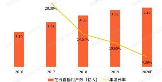
2016年-2020年中国在线直播用户规模及预测 (亿人) User Scale and its Forecast of China Online Live Streaming Market from 2016 to 2020 (100 million people)

iiMedia Research (艾媒咨询) 数据显示, 2019年中国在线直播行业用户规模达5.04亿人, 增长率为10.6%; 2020年用户规模预计达5.26亿人。艾媒咨询分析师认为, 中国在线直播行业将继续保持稳健发展, 未来行业将进入精细化、专业化运营阶段。