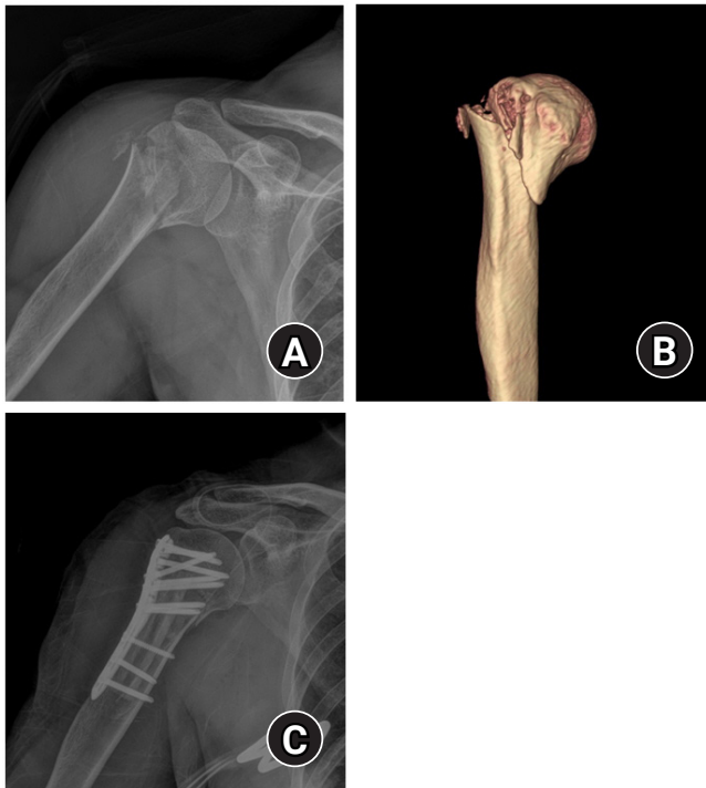
Fig. 2. A 64-year-old man with Neer classification two-part proximal humeral fracture who was treated with open plating with allogeneous fibular bone graft. (A) Preoperative anteroposterior radiography. (B) Preoperative three-dimensional computed tomography scan. (C) Postoperative anteroposterior radiography.

least three bridging calluses observed in the AP and axillary X-ray images. For radiological evaluation, neck-shaft angle was measured on the final follow-up AP images (Fig. 3A) [12]. Malunion was defined as a neck-shaft angle less than 120^\circ on postoperative radiographs during the follow-up period [11]. Plate height was measured as the distance from the lateral end of the humeral greater tuberosity to the upper end of the plate in the final follow-up AP image (Fig. 3B).