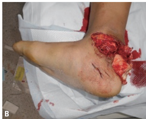
Fig. 2. (A) Operative findings of right femoral artery thrombosis in patient #1. (B) Open calcaneal fracture of the right ankle in patient #1. CFA: common femoral artery, DFA: deep femoral artery, SFA: superficial femoral artery.